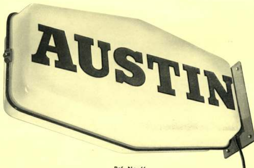
Ref. No. 66

The courier projection sign listed in our Advertising Aids Booklet has now been redesigned and incorporates a complete perspex envelope, instead of the aluminium box casing.