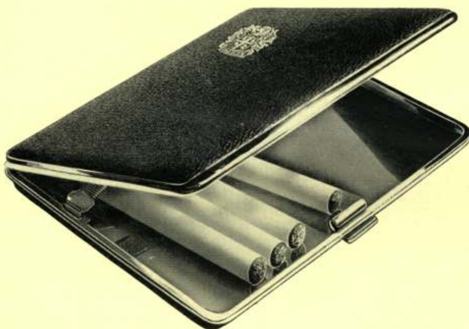
Ref. No. 72