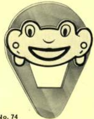
Ref. No. 74

The 'Austin-Healey' badge is chromium plated and the lettering in red enamel, with button type fitting.