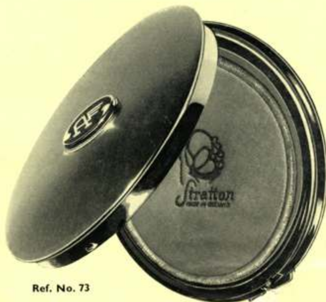
Ref. No. 73