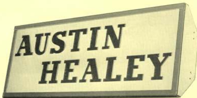
Ref. No. 67

It has been felt for some time that there is a demand for an illuminated sign featuring the Austin-Healey franchise. This has now been produced as a white perspex panel with cut-out red letters illuminated by fluorescent tubes. The overall size is 36" x 14". Suitable for A.C. 230 volt lighting.