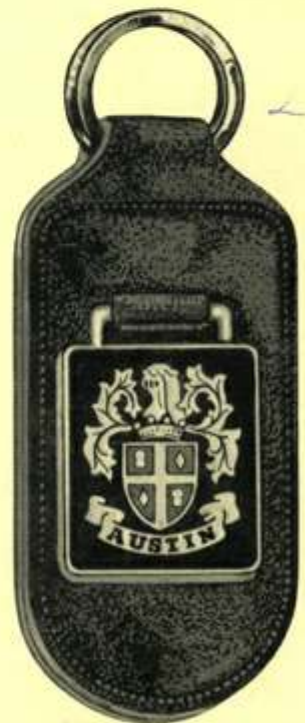
Ref. No. 76