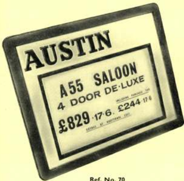
Ref. No. 70